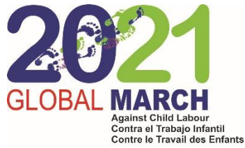
Global March Against Child Labour